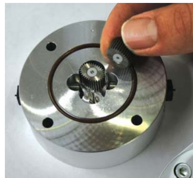
Two oval shaped gears (rotors) are the only moving parts within the measuring chamber

* see also medium & large capacity data sheets for other size meters